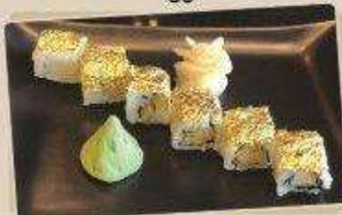
# MyDubai Roll