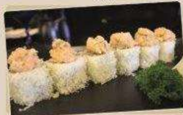
Crispy Hama Roll