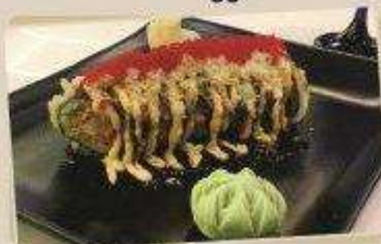
Mother of Dragons