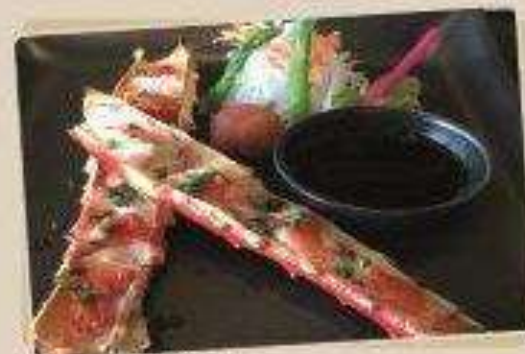
Alaskan King Crab

Grilled King Crab with Chef Special Ponzu Salsa Sauce 129