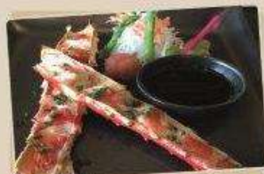
Alaskan King Crab

Grilled King Crab with Chef Special Ponzu Salsa Sauce 129