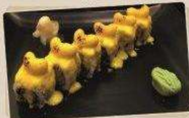
Mac N Cheese