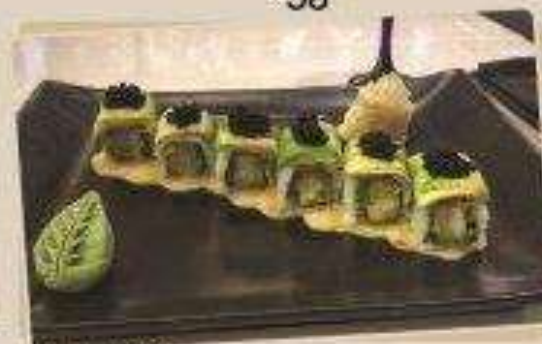
Rock N Roll