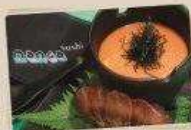
Tomato Lobster Miso