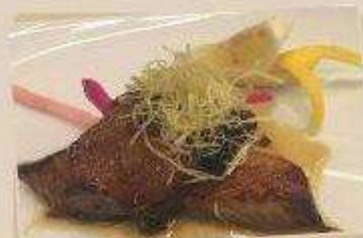
Honey Glazed Black Cod