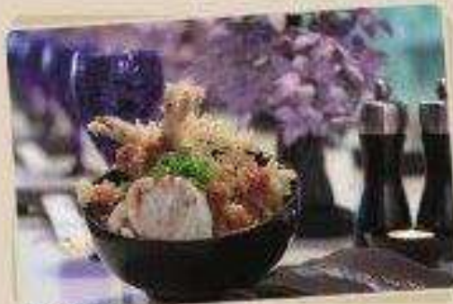
Ebi Ten Don