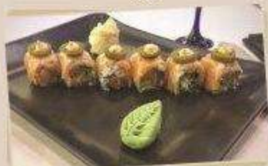
Abu Dhabi Roll