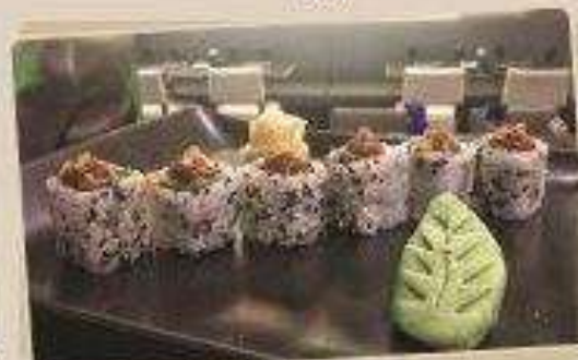
Vietnamese Beef Roll