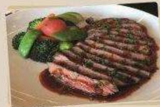
Wagyu Rib Eye Steak

Grilled Wagyu Rib Eye Steak with Japanese Style Aji Panca Sauce 109