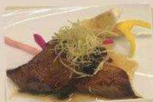
Honey Glazed Black Cod