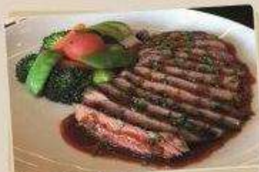
Wagyu Rib Eye Steak

Grilled Wagyu Rib Eye Steak with Japanese Style Aji Panca Sauce 109